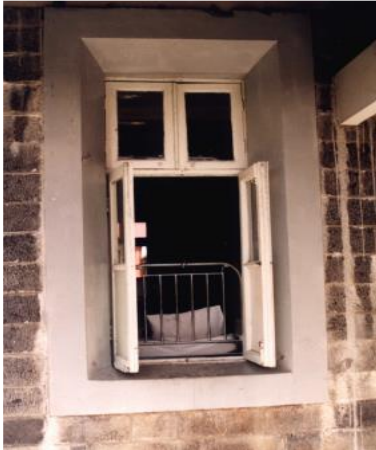
Ian outside the hospital in 1994

you.” I resisted them – I wanted to stay in the hospital, but they climbed in the window, picked me up and walked me out. The doctor came and tried to physically restrain them, but they pushed him out of their way.