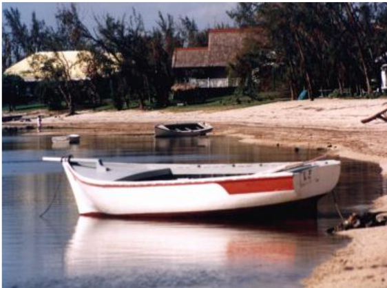
Riviere Noire, where the boat landed and Ian was left

I knew the others could safely swim in from the reef because the jellyfish were on the outside of the reef. But he took off, and I was left alone on the side of the road in the middle of the night. Hope drained from me, and I lay down to rest.