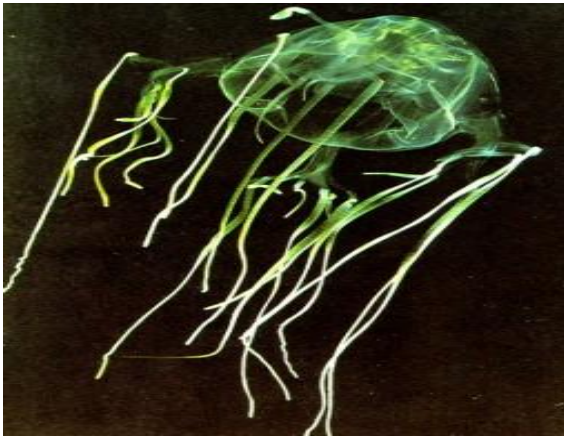
Box Jellyfish A Glimpse of Eternity

As it floated away, I watched it, intrigued, as it was a very odd-looking jellyfish. It had what appeared to be a squid's bell-shaped head, but its back was box-shaped and it had very unusual, transparent, finger-like tentacles stretching way out behind it. I'd never seen that type of jellyfish before, but I turned away from it and continued with my crayfish search.