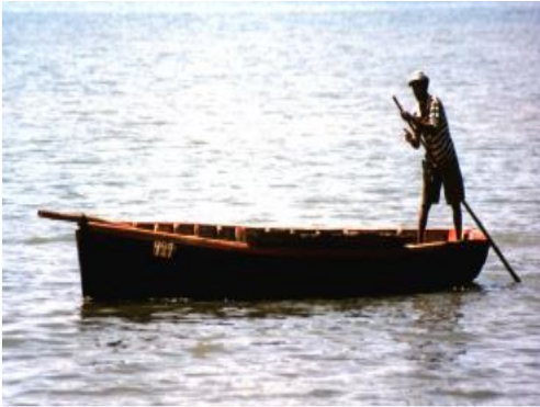
Wooden boat in Mauritius

But they replied, “No, it’s too heavy, get the young boy to take you ashore.” So, this young kid was pushing the boat to shore with a pole.